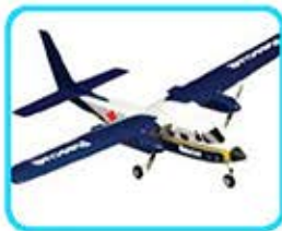
Medical Air Service