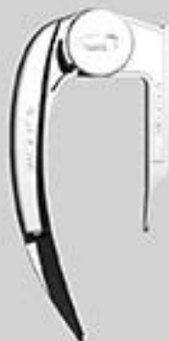
Miller 1 + Macintosh 4 RB3000