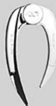
Macintosh 3 + Macintosh 4 RB4000