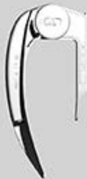
Miller 1 + Macintosh 3 RB2000